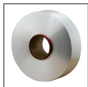
Fully Drawn Yarn (FDY)