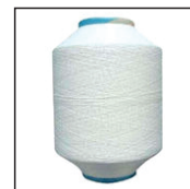
Mother Yarn (MY)