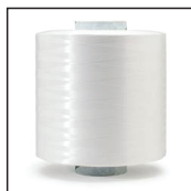
Partially Oriented Yarn (POY)