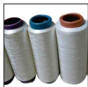
Air Textured Yarn (ATY)